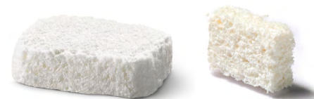
Geistlich Fibro-Gide® and Geistlich Bio-Oss Collagen® provide soft tissue volume and long-term stability

“The importance of the “one-two punch” of ROUTINE phenotype-conversion using Geistlich Fibro-Gide® in conjunction with bone grafting the >2mm buccal gap with Geistlich BioOss-Collagen® provides excellent buccal convex tissue maintenance long-term.”